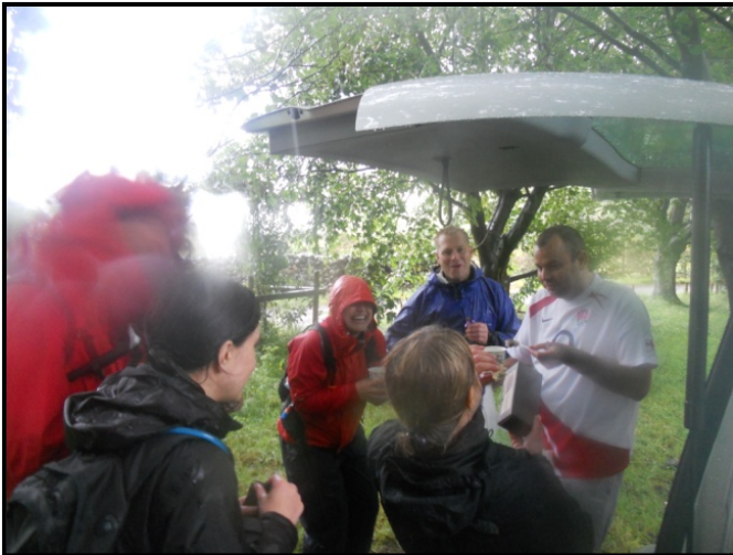
The best cup of tea in the world ever!

We had to change and refuel again, but this was now slowing us down. The climbing and the driving we did in the suggested time but all the messing around in terrible conditions was starting to cost us too much time.